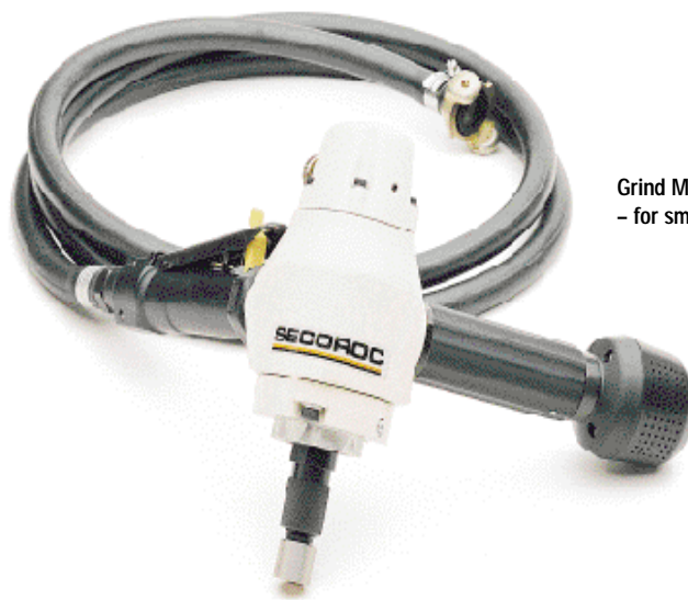
Grind Matic HG – for smaller operations

For small field operations, Grind Matic HG is the right choice. Grind Matic HG is a complete manual grinding system consisting of a pneumatic grinding machine with a specially designed chuck, Quick Snap, and matching grinding cups.