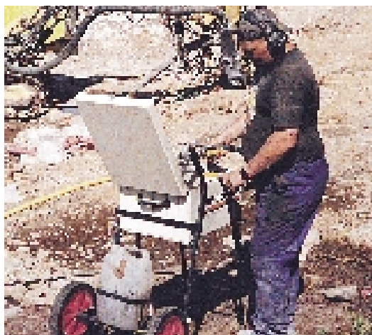
Right: Grind Matic Manual B – for small to medium-size operations