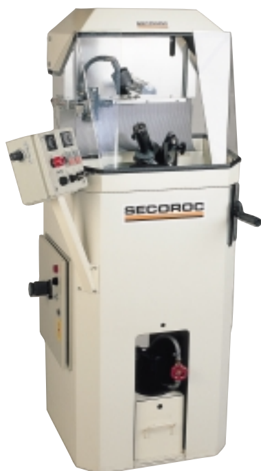
Left: Grind Matic BQ2 – for larger operations